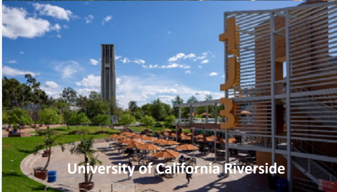
University of California Riverside