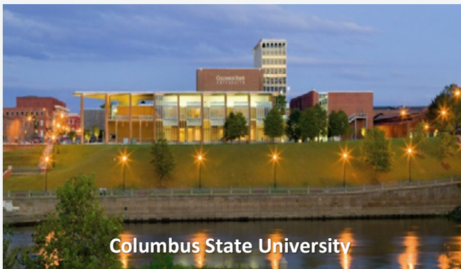
Columbus State University