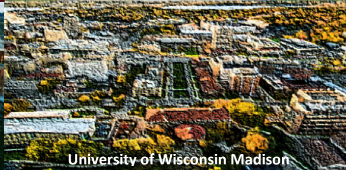
University of Wisconsin Madison