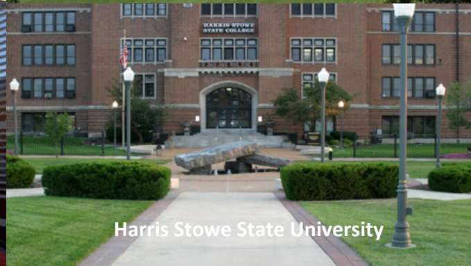
Harris Stowe State University