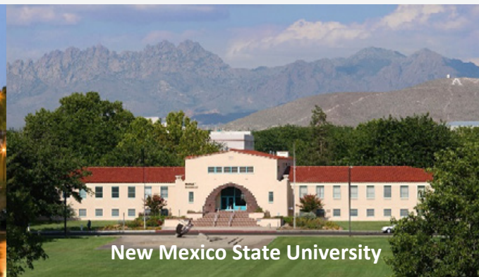
New Mexico State University